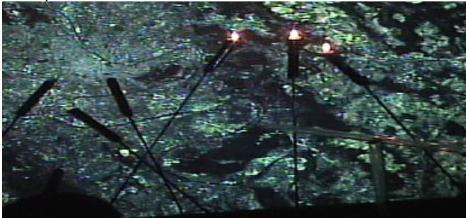
Fig. 1. The installation: candles, tube, and the projected city.

Fire and breath have been important media elements of the contemporary arts (e.g. Burning Man [1]). The Italian conceptual artist Piero Manzoni produced a series entitled "The Breath of the Artist" [2]. In Hydrogen Wishes we capture the breath of the visitor and use the serenity of candle flame as an activating agent. Referencing the engaging process of making a wish, we allude to the power of dreams, the mystique of a fire breathing dragon as a granter of wishes. The wishes "granted" are kept and contextualized, both visually and acoustically and presented to subsequent viewers.