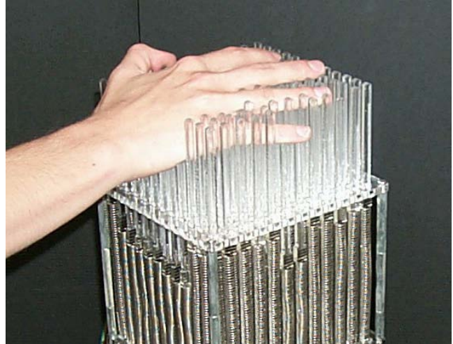
Figure 1 User interacting with the MATRIX interface.

The MATRIX is a tactile interface that controls a multi-modal musical instrument. It functions as a versatile controller that can be adapted to new tasks and to the preferences of individual performers in a variety of different environments. The interface provides musicians with a sculptable 3-D surface to control sound and music through a bed of push rods (see figure 1). Based on a user's real-time input, musical mapping algorithms control different types of signal processing algorithms.