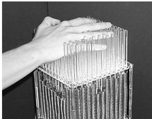
Figure 1. The MATRIX in performance.

I begin with a discussion of the MATRIX at the system level, covering the design criteria, design approach, and physical interface from a practical point of view. Finally I discuss musical applications and future directions for the project.